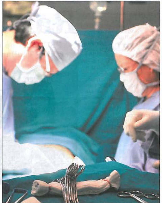
CUTTING EDGE: Professional services and cheap prices are luring more medical-tourists to Phuket.

The main driving force behind this industry expansion is the difference in price.